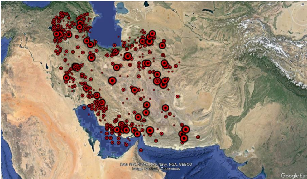
Figure 1: Recorded earthquakes 1900-1963